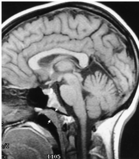
Fig 1. Sagittal T1-weighted MR image shows the technique used to measure maximum adenoidal width perpendicular to the skull base (between arrows). In some cases the measurement was anteroposterior in direction, depending on the configuration of the adenoidal tissue.

The sagittal T1-weighted (500–600/11–17/1 [repetition time/echo time/excitations], 256 \times 192 matrix, 24-cm field of view) MR images of the 42 subjects were reviewed blindly and independently by two neuroradiologists. The readers measured the maximal dimension of the nasopharyngeal lymphoid tissue at a plane roughly perpendicular to the skull base using the scales provided with the images (Fig 1). Measurements were rounded to the nearest millimeter. The mean value of the two neuroradiologists' measurements was correlated with patients' age and HIV status. MR images from an additional group of HIV-positive patients ( n = 26 ) obtained between February 1991 and April 1992 were evaluated in an identical manner and were combined with the first set to assess the relationship between nasopharyngeal width and CD4 count, hematocrit, and white blood cell count at the time the MR examination was performed. Fifty-six MR studies were performed in the 47 HIV-positive persons (21 from the 1995–96 group and the 26 additional patients). A hematologic study including either a hematocrit ( n = 56 ), white blood cell count ( n = 52 ), or CD4 count ( n = 21 ) was performed within 3 weeks before or after the MR examination in every patient.