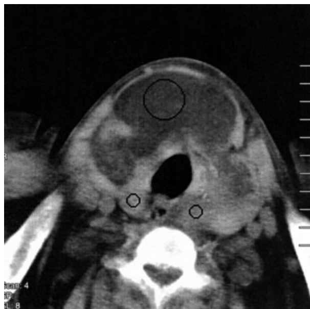
FIG 1. Unenhanced axial view CT scan shows a well-circumscribed, predominantly fatty mass (Hounsfield units H. = -60 ) of the thyroid gland. The mass causes enlargement of the isthmus and extends to both right and left lobes. Small portions of the right and left lobes have a soft tissue attenuation (Hounsfield units = +50 ), consistent with normal thyroid tissue.

normal thyroid gland. CT of the thorax showed left upper lobe atelectasis, fibrosis, and cicatricial emphysema in the left upper lobe, which were considered to be sequelae to previous tuberculous infection. MR images of the neck confirmed the fatty nature of the mass (Fig 2). Fine needle aspiration was performed under ultrasonographic guidance and revealed thyroid epithelial cells and fat cells containing mesenchymal elements, supporting the diagnosis of thyrolipoma. A skin biopsy was negative for amyloid deposition.