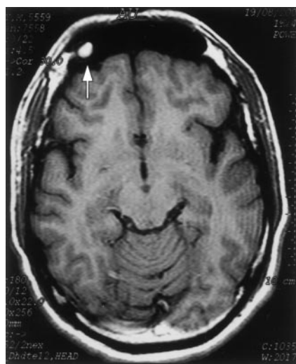
FIG 2. Axial view T1-weighted MR image obtained at a follow-up study 2 months later. Only a small remnant is seen (arrow). Note that because of differences in angulation of the axial plane, the brain morphology is different from that shown in Figure 1 but the morphology of the frontal sinus is similar.

which is the most severe grade, results in abrupt and severe pain lasting occasionally >24 hr and is always the result of the squeeze. Plain films may show a fluid level and/or a polypoid mass representing submucosal hemorrhage and free bloody exudate.