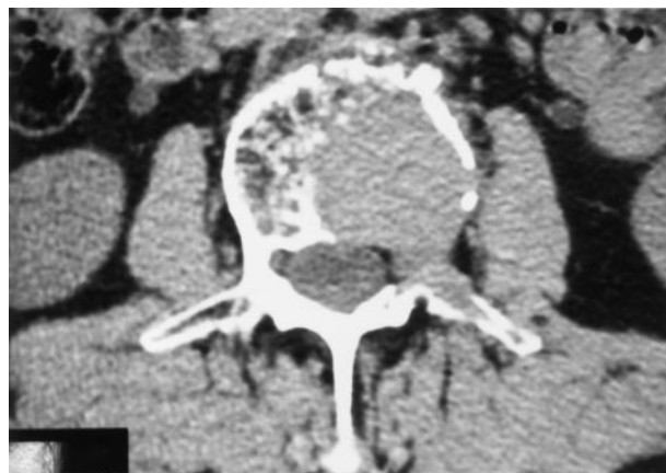
FIG 1. CT scan at L2 level. Note destruction of posterior vertebral wall and pedicle.

The patient awoke from neuroleptic anesthesia without clinical evidence of neurologic compromise. Postoperative CT was performed and revealed posterior displacement of the tumor mass with encroachment on the thecal sac but no evidence of epidural extension of PMMA. The patient was discharged 2 hours after the procedure and reported notable reduction of back pain. He returned for follow-up 2 weeks later and reported a reduction of his back pain from a 10 on the visual assessment pain scale and scheduled narcotic use to a 3 with intermittent narcotic use. He had no evidence of neural compromise.