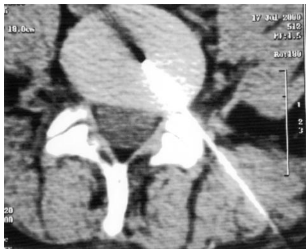
Fig 1. Puncture at L4-L5 performed under CT guidance.

patients with oxygen-ozone therapy and compared the outcome in patients receiving medical ozone alone with that in patients who also received a corticosteroid and anesthetic mixture injected at the same session.