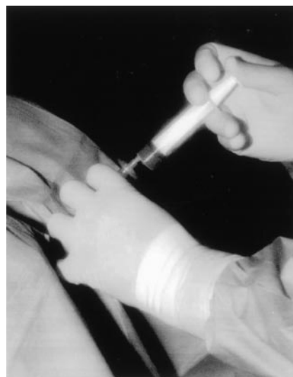
Fig 2. Injection of the oxygen-ozone mixture through a millipore filter.

Selection criteria for oxygen-ozone therapy were the following. Clinical criterion was low back pain resistant to conserva-