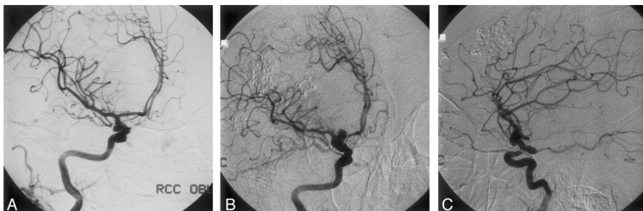
FIG 2. Patient 2, a 27-year-old woman with two de novo aneurysms.

C, DSA, right carotid injection, contralateral oblique view, demonstrating both de novo aneurysm (arrows).