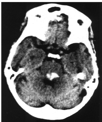
FIG 1. Dorsal PPH.

CT scan in a 65-year-old man who was alert on admission, with mild gait ataxia. Hematoma volume is 2.5 mL. Patient outcome was excellent (GOS score 5).