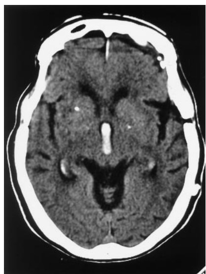
FIG 2. CT scan showing an intraventricular hemorrhage.