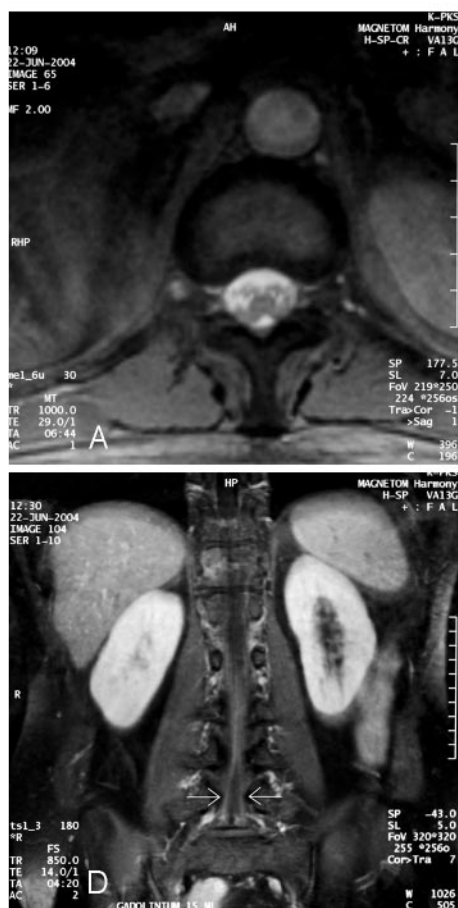
Fig 2. Axial 7-mm T2* image (A) at the level of conus medullaris shows normal finding.

Gadolinium-enhanced 4-mm sagittal (B) and 5-mm axial (C) T1-weighted MR images show enhancement of the anterior nerve roots (arrow) at the level of conus medullaris.