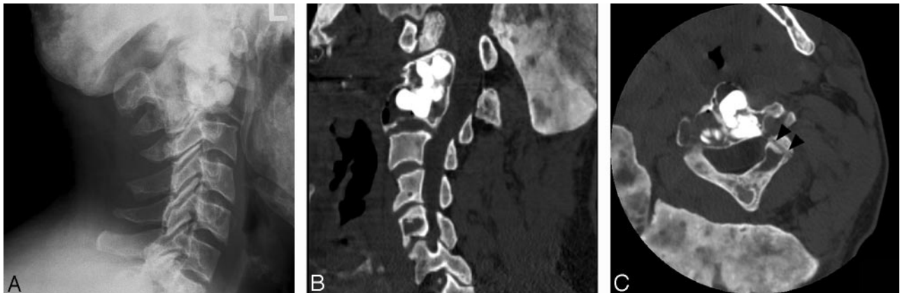
Fig 4. Postprocedural conventional radiographic and CT scans obtained in similar locations as in Fig 1. Note the deposition of the bone cement in multiple compartments of the vertebral complex and the tract of the cannula (arrowheads).

In summary, in a unique patient with polyostotic fibrous dysplasia the feasibility of directed PMMA injection by using a wire-guided catheter via a transpedicularly placed needle is illustrated.