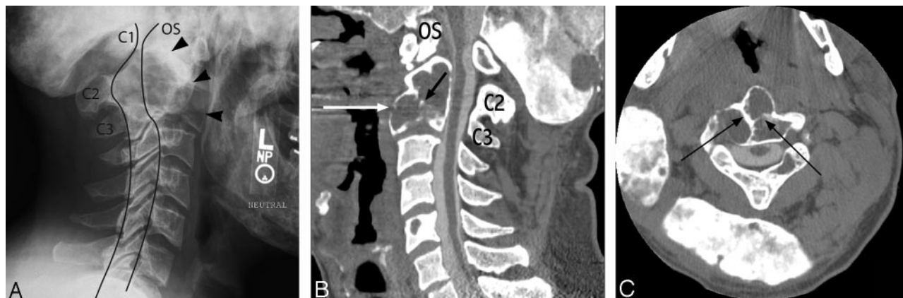
Fig 1. Lateral conventional radiograph of the cervical spine (A), sagittal postmyelogram CT reconstruction of the cervical spine (B), and axial (C) postmyelogram CT scans of this patient with a multiseptated (black arrows) C2–C3 vertebral complex (arrowheads) and disruption of the anterior wall of the vertebral body (white arrows). Note os odontoideum (OS), cord atrophy, and anterior subluxation of C1 on C2. The anterior and posterior spinal laminar lines are outlined.