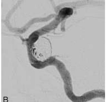
Fig 1. Examples of observer variability in the assessment of completeness of cerebral aneurysm therapy. A carotid aneurysm before ( A ) and immediately after ( B ) endovascular therapy, which was assessed variably as "complete," "dog ear," and "incomplete."

hemorrhagic events in these patients are quite uncommon. With such a low event rate for subarachnoid hemorrhage after endovascular therapy, studies of very large numbers of patients over a number of years would be necessary for rate of subarachnoid hemorrhage to be a practical outcome measure. The International Subarachnoid Aneurysm Trial (ISAT)<sup>14</sup> is a trial that has enrolled enough patients (1073 treated with coils) and follows them over a long enough period of time (at least 5 years) that it can make a meaningful assessment of the rehemorrhage rate. However, it is not practical for all studies of outcomes of endovascular cerebral aneurysm therapy to be so large. Thus, investigators use completeness of coil therapy and angiographic recurrence as surrogate markers for risk of future hemorrhage, making the assumption that risk of future hemorrhage correlates with degree of persistent filling of the aneurysm with contrast during angiography.