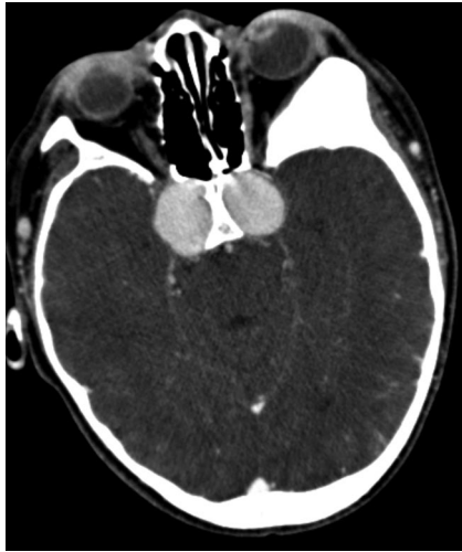
Fig 1. CT postcontrast, part of CTA, demonstrates bilateral marked enlargement of the bilateral cavernous internal carotid arteries.