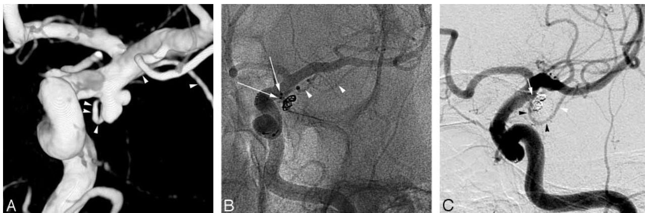
Fig 1. Images of a 63-year-old woman who presented with subarachnoid hemorrhage. A , 3D volume-rendering image in oblique projection reveals an anterior choroidal artery aneurysm with daughter sac. The anterior choroidal artery is incorporated into the aneurysm neck. B , Unsubtracted image in working-projection obtained during the procedure. The aneurysm is treated with the double-catheter technique. Note 2 radiopaque markers of the tip of the microcatheter near the aneurysm neck. C , Postembolization control angiography in working-projection reveals near complete occlusion of the aneurysm sac.

Surgical clipping was performed with a standard technique. In most cases, microvascular Doppler ultrasonography was used to identify the flow into the AchoA. Monitoring of intraoperative motor-evoked potentials (MEPs) was not used.