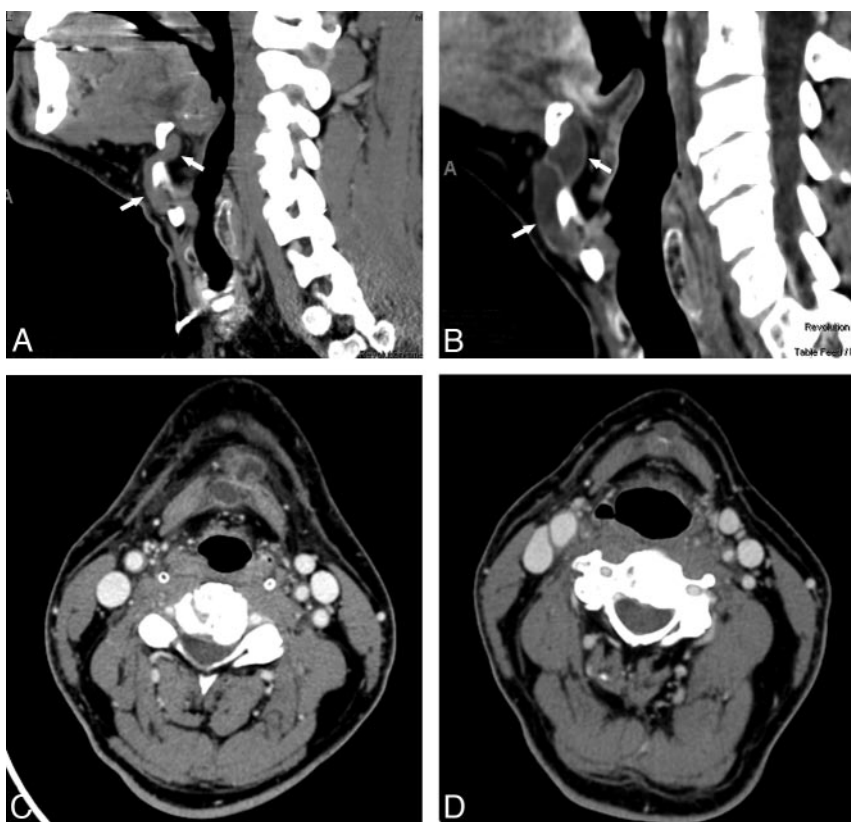
Fig 2. A 54-year-old man before and after IMRT for treatment of a T2N2B base of tongue squamous cell carcinoma. A , Sagittal reconstructed image of a contrast-enhanced CT series before RT showing an isodense structure coursing from a location posterior to the hyoid, anteroinferiorly through the thyrohyoid membrane, and finally into a position anterior to the thyroid cartilage ( arrows ). B , Sagittal reconstructed image obtained 30 days after the completion of RT. The lesion is clearly larger and more cystlike ( arrows ). C , Axial, contrast-enhanced CT image obtained 7 months after the image in 2 B , during an asymptomatic period. The cyst appeared more complex and irregular, with suspected inflammatory changes peripherally and in the nearby platysma muscles. Infection was suggested. Results of an ultrasound-guided biopsy revealed a benign cyst. It was finally hypothesized that self-massage for the purpose of improving lymphatic drainage and alleviating edema caused irritation of the cyst and the adjacent soft tissues. D , Axial, contrast-enhanced CT image obtained 90 weeks after RT. Inflammatory changes had long since resolved, and the cyst is both smaller and less conspicuous, as was generally the case with our series of cases.

tory changes, and a diagnosis of TGDC infection was posited (Fig 2). Although the patient was asymptomatic and was without clinical signs of infection, the finding of cyst enlargement was concerning to the referring clinician. A sonography-guided biopsy was performed; microscopic analysis revealed proteinaceous fluid and histiocytes, and a diagnosis of a benign cyst was made. It was considered possible in this case that