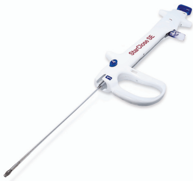
Fig 1. The StarClose SE vascular closure system (6F introducer sheath not shown).

manual compression were to remain flat for 6 hours, after which time they were permitted activity.