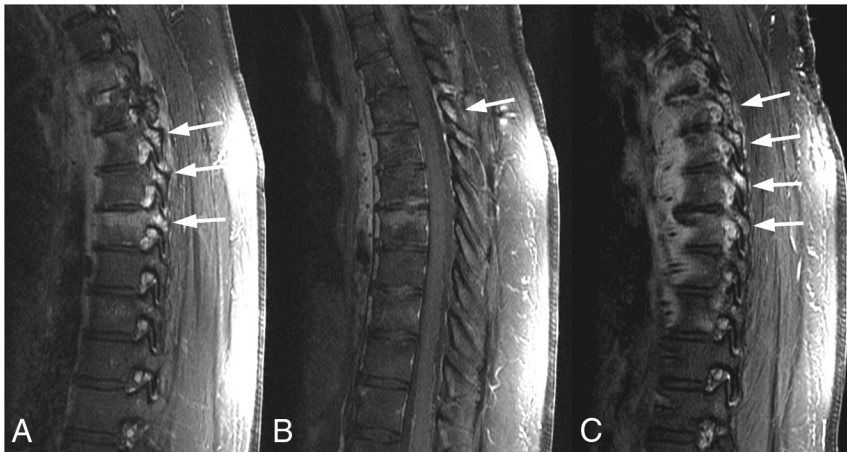
FIG 3. MR images in a 32-year-old woman with back pain. Sagittal T1-weighted fat-saturated images of the thoracic spine following administration of gadolinium demonstrate multilevel enhancement (arrows) of the spinous processes (B) and bilateral facet joints (A and C).