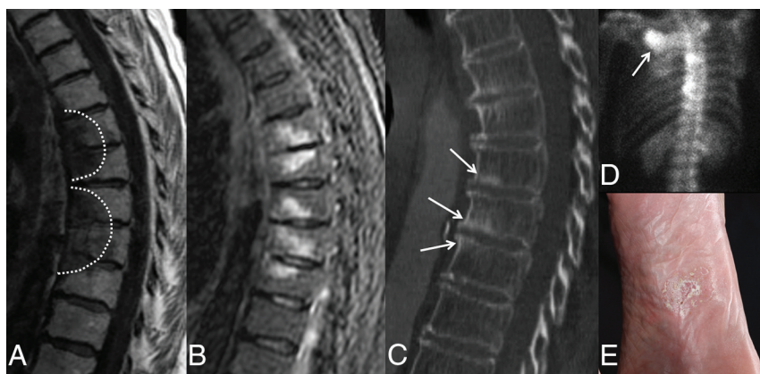
FIG 2. MR imaging, CT, and bone scan of the thoracic spine in a 74-year-old woman with back pain. Sagittal T1-weighted (A) and STIR (B) images demonstrate hypo- and hyperintensity, respectively, in a curvilinear or semicircular pattern ( dashed line ) in contiguous vertebral body segments. Note the absence of abnormal signal within the intervertebral disc spaces. C, Sagittal CT image shows associated sclerosis ( arrows ) corresponding to levels of abnormal increased signal on MR imaging. D, Bone scan, posteroanterior view, demonstrates focal areas of increased radiotracer uptake within thoracic vertebral bodies and the right sternoclavicular joint ( arrow ). E, Previously undiagnosed plantar pustulosis was evident on physical examination.

MR imaging was available for 16 patients (89%). Many patients came to our institution with imaging from other facilities. Therefore, there was variation in the MR imaging field strength, sequences, and imaging parameters. T1-weighted images were available in all cases; 1 patient (6%) did not have T2-weighted imaging. Vertebral body low-signal intensity on T1-weighted images was seen in 15/16 patients (93%) with corresponding high-signal intensity on T2-weighted images in 12 patients (75%), compatible with bone marrow edema (Fig 2A, -B). One patient (6%) had mixed hypo-/hyperintensity on T1-weighted images, while 3 patients (18%) had mixed hypo-/hyperintensity on T2-weighted images, suggestive of concomitant bone marrow edema and cancellous bone sclerosis. Gadolinium-based contrast was administered in 9 patients in whom MR imaging was available (56%), with 100% of patients demonstrating enhancement in the same distribution as the signal changes described above. Vertebral body corner erosions were not observed in any patient.