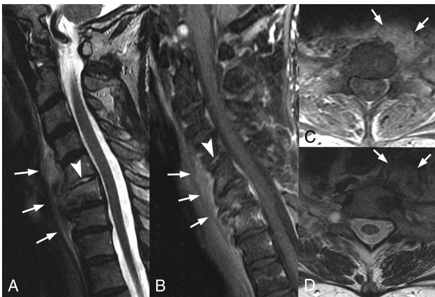
FIG 4. MR images in a 69-year-old woman with cervical and thoracic back pain. A, Sagittal T2-weighted fat-suppressed image of the cervical spine demonstrates paravertebral soft-tissue thickening (arrows), extending from the C3–C4 interspace to T3. Note the abnormally high T2-weighted signal within the C5–C6 disc (arrowhead). B, Sagittal T1-weighted gadolinium-enhanced fat-suppressed image demonstrates corresponding enhancement of the paravertebral soft tissue (arrows) with disc space enhancement (arrowhead). C, Axial T1-weighted gadolinium-enhanced fat-suppressed image demonstrates enhancement of the thickened paravertebral soft tissues (arrows). D, Axial T2-weighted fat-suppressed image further demonstrates the extent of the paravertebral soft-tissue thickening (arrows).