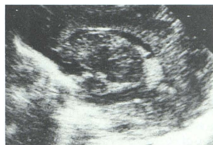
Fig. 3.—Parasagittal sonogram. Glomus of choroid plexus of left ventricle contains well defined 3 mm cyst.

but three infants were term at birth, and eight of the infants were "growth-retarded." Only three of the infants survived; most of the rest had markedly compromised gestations or severe antenatal handicaps causing death. Of the 22 cases, the "abnormal gestations" included: two cases of severe blood Rh incompatibility and hydrops fetalis; two cases each of German measles and cytomegalic inclusion disease; one case of toxoplasmosis; two cases each of first-trimester influenza and nonspecific infections at 28 weeks (both with high fever); one case of severe toxemia; three cases of bleeding throughout pregnancy; and one case of sudanophilic leukoencephalopathy. Four cases demonstrated histologic evidence of old hemorrhage (macrophages laden with iron pigment). Larroche described these subependymal cystic formations as "pseudocysts" lined with immature, undifferentiated cells, which may be seen in various locations. The most common location was the germinal eminence at the level of, or anterior to, the foramen of Monro; other locations were in the occipital and sphenoidal regions of the subependymal germinal matrix zone (fig. 3) and the deep cerebral regions of the cauda and putamen.