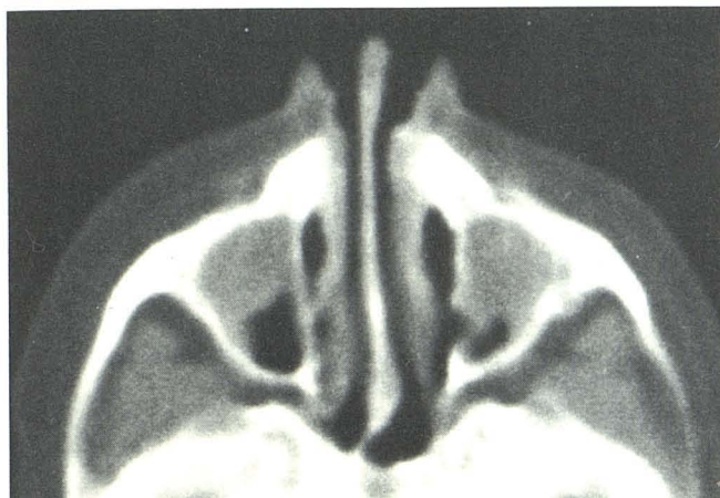
Fig. 3.—Mucosal thickening and/or loculated fluid in the maxillary sinuses of a 4-year-old girl with negative history and physical examination for upper respiratory inflammation.