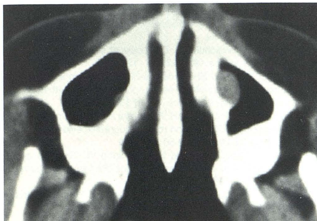
Fig. 4.—Bilateral polypoid soft-tissue densities in a clinically normal 14-year-old girl.

exact test. When the prevalence rates of patients with abnormal sinuses in the URI negative and URI positive populations were compared, no statistically significant differences were found ( p < 0.05 ). With the exception of the 6 and older age group, however, a higher prevalence rate of abnormalities was seen in the URI positive patients. In the under 1 year age group, the abnormal rates were 62% in URI negative and 100% in URI positive groups, with rates of 17% and 35% for the respective groups in the 1-to-6 age range. Comparisons based on differences in age did demonstrate statistically significant differences in the prevalence rates of patients with abnormal sinuses. Patients under 1 year old had significantly greater rates than those over 1 year in both the URI negative and URI positive groups as well as for the entire patient population. When the prevalence rate of abnormal sinuses for all patients less than 1 (72%) is compared with the rate for all patients older than 1 (22%), the difference is significant ( p < 0.0001 ).