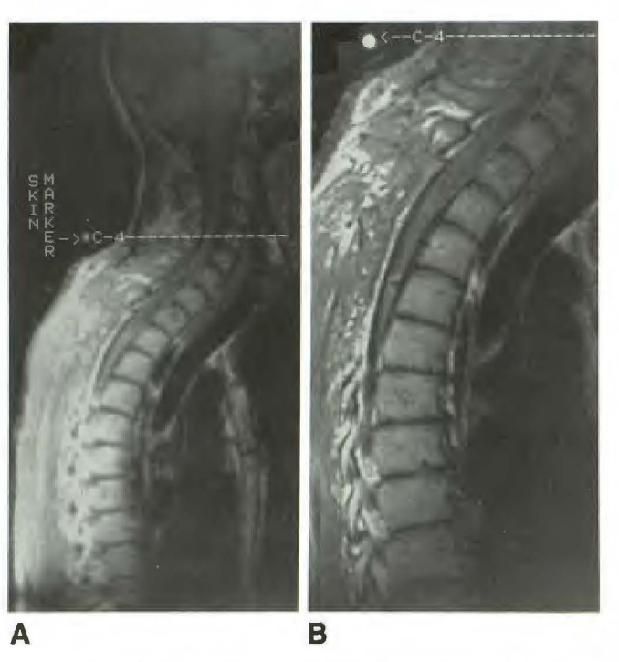
Fig. 1.--A, On sagittal localizer, surface marker (cod liver oil capsule) is at C4 level.

B, Sagittal T1-weighted image of thoracic spine shows surface marker clearly. It can be localized to level of C4 from image in A. Subsequently, any thoracic upper or mid-vertebral body can be accurately identified by using this reference point.