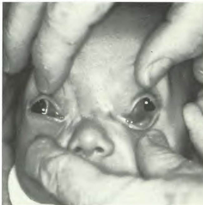
Fig. 1.—Preoperative photograph of patient demonstrates apparent hypertelorism with bilateral medial intraorbital cystic masses. Note saddle-nose deformity.

pathologically confirmed as arachnoid. The frontal lobe was abnormal with several vertical sulci but normal gyri; the temporal lobe appeared normal. Cerebral tissue extended from the frontal lobe toward the cribriform plate, which was in an unusually low position. Bilateral olfactory nerves were seen. The falx was incompletely developed. Two tongues of cerebral tissue exited the skull through small bilateral bone defects located superior and lateral to the low-lying cribriform plate. The encephalocele stalk was amputated and evacuated from the medial orbit. Attempts to remove the meningeal capsule from the orbit were unsuccessful because it adhered to the periorbita. The