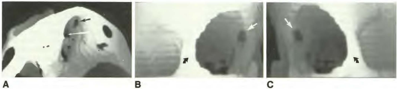
Fig. 2. — A , Three-dimensional CT reconstruction of anterior cranial fossa. Perspective is that of looking from above left orbital roof toward right orbit. There is a low-lying cribriform plate ( white arrow ) as well as osseous defect ( black arrow ) in anteromedial wall of right orbit through which meningoencephalocele passes from cribriform region into right orbit. A symmetric osseous defect of left orbit is not seen on this view.

B , Three-dimensional CT reconstruction of right orbit. Perspective is that of looking toward medial wall of right orbit from in front. Black arrow denotes frontal process of zygomatic bone. White arrow points to osseous defect at juncture of ethmoid, frontal, maxillary, and lacrimal bones through which meningoencephalocele from low-lying midline brain passes into orbit.