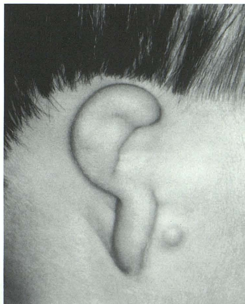
Fig. 3. Grade III microtia.

We have developed a rating scheme based on the CT scan to grade the candidacy of our patients for surgery. The scale is based on a best possible score of 10 (Table 1). In the grading scheme, the stapes is assigned 2 points, since