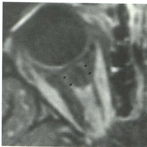
Fig. 3. T1-weighted (600/20/2) post-gadolinium 3-mm axial scan (obtained with fat suppression) demonstrates meningioma of the posterior two thirds of the right optic nerve sheath. Anterior to the meningioma there is dilation of the optic nerve sheath (arrows). In the central portion of the dilated nerve sheath is an atrophic optic nerve.