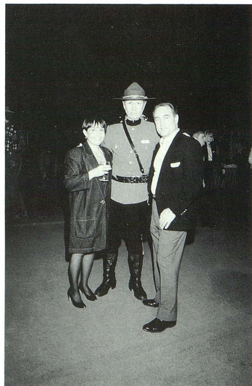
Security at the meeting was top-notch.