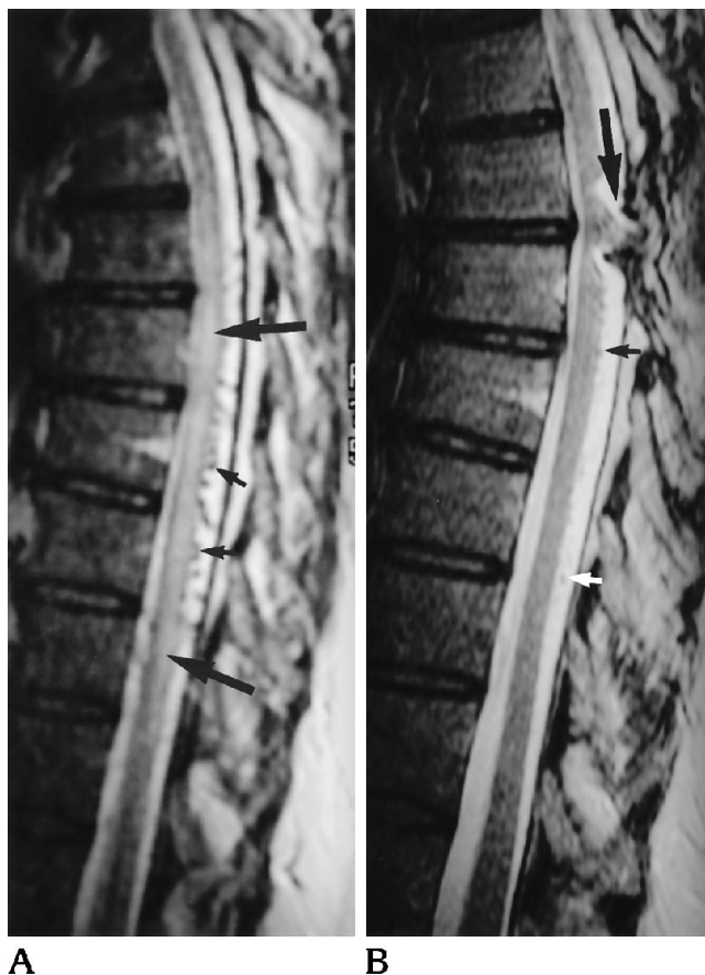
A Fig 1. Case 8. A , T2-weighted sagittal thoracic MR shows perimedullary flow voids on the dorsal aspect of the cord ( short arrows ) and a diffuse intramedullary hyperintensity ( long arrows ) that extended to the conus.

B , Posttreatment (17 months) T2-weighted MR shows resolution of the hyperintensity and only subtle flow voids on the dorsal aspect of the cord ( short arrows ). Artifact from metallic clips is seen in the high thoracic region ( arrow ).