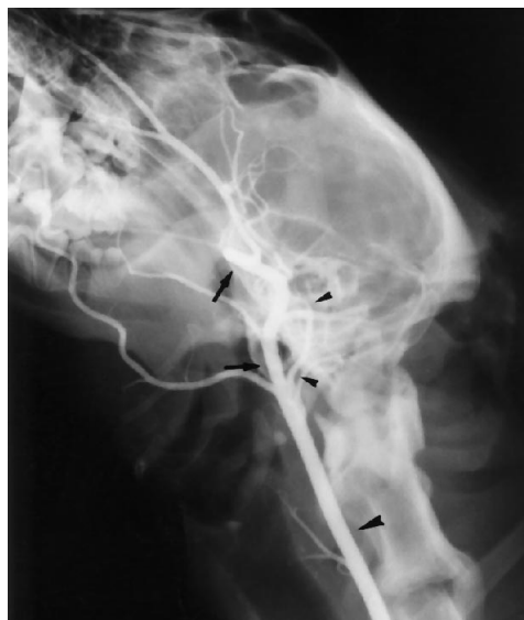
Fig 3. Carotid angiogram in a dog. Blood pressure monitoring sites are at the C-2 level in the common carotid artery (large arrowhead), the proximal and distal portions of the external carotid artery (arrows), and, when possible, the proximal and distal portions of the internal carotid artery (small arrowheads). In dogs, the internal carotid artery is very small compared with the external carotid artery.

An important technical matter is how the blood pressure changes in small arteries were measured. When coaxial catheters were displaced or wedged by the impact of the injection, we could not get correct measurements. The Mikro-tip catheter, which has a pressure sensor at the tip, was better in this regard than the other coaxial catheters,