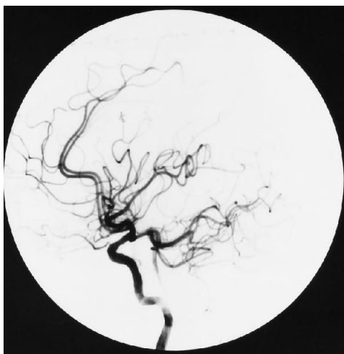
Fig 1. Angiogram shows reflux of contrast medium into the basilar artery during internal carotid angiography. This patient had no stenosis of the vertebral and subclavian arteries.

was stable. The injection catheter tip was placed at the C5-6 level in the common carotid artery and the monitoring catheter tip was placed at the ipsilateral mid C-2 level in the common carotid artery. An automatic power injector (Contrac 4E, Siemens, Germany) was used for the injection of contrast material.