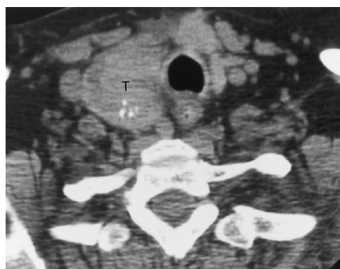
Fig 1. Incidental right thyroid mass reported on initial examination. Patient was being examined for a parotid abscess, but the unenhanced CT scan revealed a right thyroid mass (T) with stippled calcification. As the lesion was not palpable, a thyroid function test and a nuclear medicine study (revealing a cold lesion) were performed, and two specimens were obtained from CT-guided FNA, which showed changes of a multinodular goiter.

Note.—TFT indicates thyroid function tests; FNA, fine-needle aspiration; and NM, nuclear medicine scintigraphy.