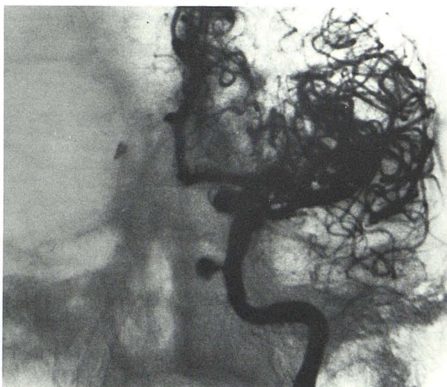
Fig. 4.—Case 4. Anteroposterior internal carotid artery angiogram. Aneurysm projects medially from cavernous part of left internal carotid artery.

40 years after initial trauma. The initial episodes of epistaxis were seldom fatal; bleeding usually recurred and became more severe with time.