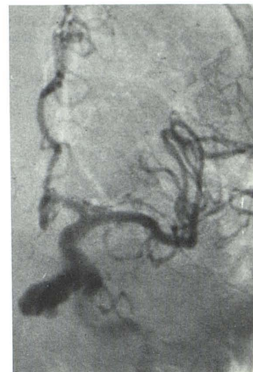
Fig. 3.—Case 3. Large aneurysm of cavernous segment of left internal carotid artery projects inferiorly and medially into sphenoid sinus.