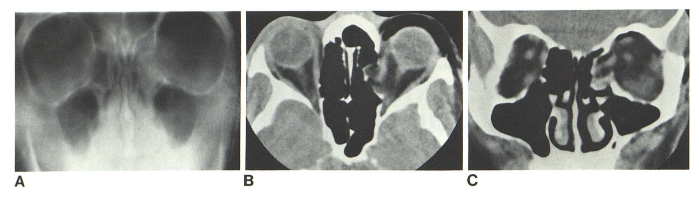
Fig. 1.—Case 1. Blow-out fracture of medial orbital wall with entrapment of medial rectus muscle. A, Polytomogram. Fracture of medial orbital wall and orbital content herniation in ethmoid sinus on left. B, Axial scan. Blow-