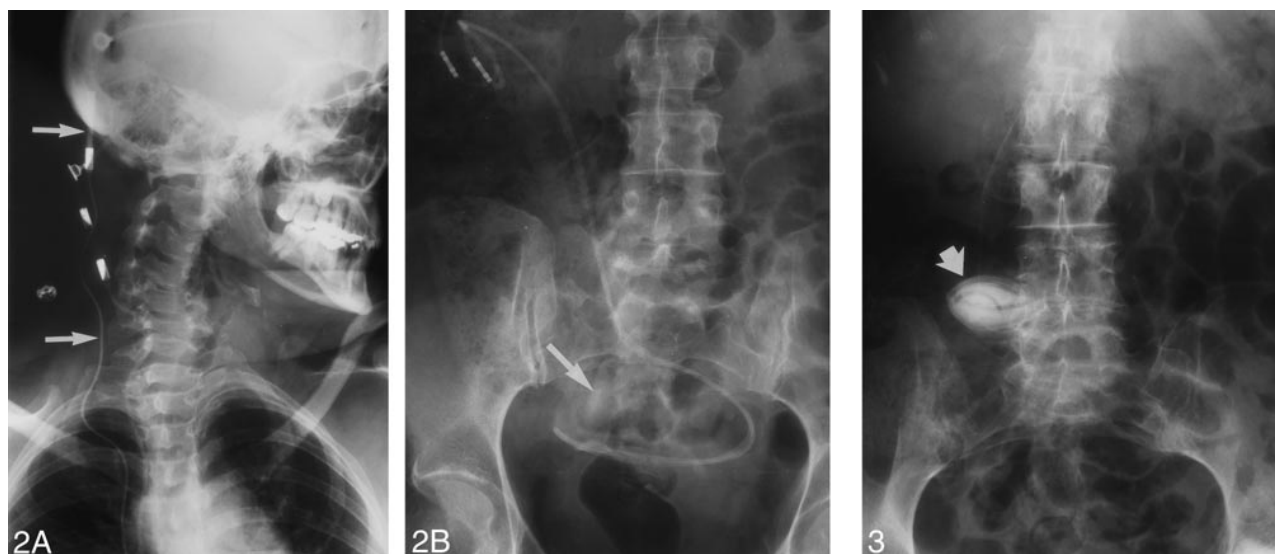
FIG 2. Patient 2 (with a Cordis Unishunt system).

A, 12-minute film at the level of the valve shows contrast material in one of two ventriculoperitoneal shunts but no forward motion of contrast agent (arrows). Shunt flow at this point is abnormal.