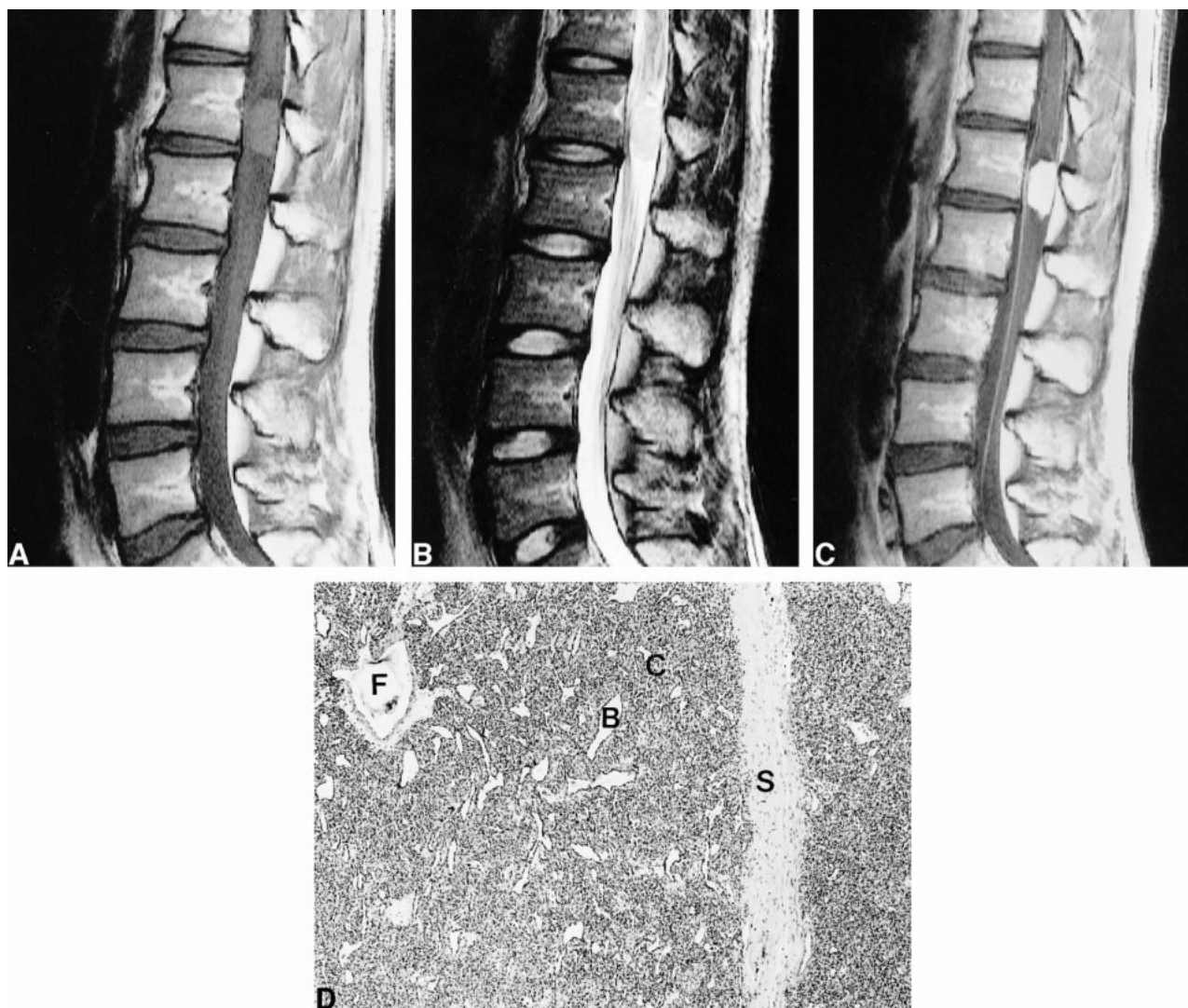
FIG 1. Case 1.

Sagittal T1-weighted (A), T2-weighted (B), and contrast-enhanced T1-weighted (C) MR images show a well-defined solid enhancing mass within the thecal sac at the L1 level. A vertical linear enhancing structure within the thecal sac, as seen on C, is presumably due to a radiculomedullary vein rather than a compressed root with breakdown of nerve-blood barrier. On a photomicrograph of capillary hemangioma (D), the excised tumor consists of lobules of small capillary-sized vessels (C) separated by fibrous septa (S). Note a feeding vessel (F) with larger caliber size and medium-sized branching vessels (B) (H&E, \times 40 ).