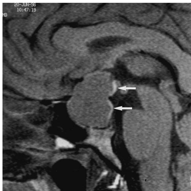
FIG 4. Sagittal T1-weighted image (500/14/3) in a 33-year-old woman with a 26-mm GH-secreting macroadenoma. No postoperative DI occurred. The figure 3 appearance of the high-signal-intensity area (arrows), which corresponds to ADH storage, is considered eutopic and ectopic at the same time. This shape is probably due to the compression of the hypothalamohypophyseal tract filled with ADH vesicles by the sellar diaphragm.

shape (Fig 1). In only one case (4%), was the bright spot ectopic; it was observed at the infundibulum (Fig 2). In group B, the hyperintense signal corresponding to the site of ADH storage was visualized in 19 (70%) of 27 cases. It was seen in the sella in only five (26%) of 19 cases and was therefore ectopic in the large majority of the cases (14 [74%] of 19 cases); in two cases (11%) it was eutopic and ectopic at the same time. The shape was either round or flat (Fig 3), or it had a striking figure 3 appearance when the ADH storage area was ectopic and eutopic at the same time (Fig 4).