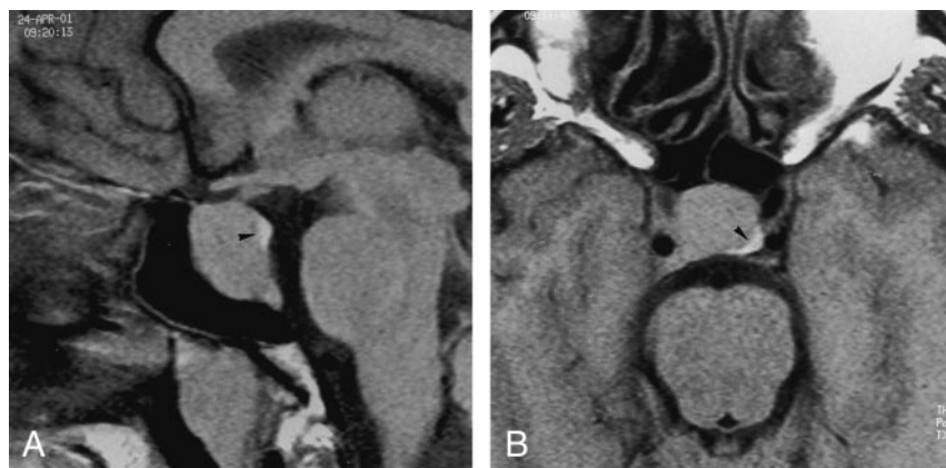
FIG 1. T1-weighted images (500/14/3) in a 37-year-old man with a 16-mm growth hormone (GH)-secreting macroadenoma with an infrasellar extension (group A) show the eutopic bright spot (arrowhead) within the sella, immediately anterior to the dorsum sella and mildly displaced on the left side. No postoperative data were available.