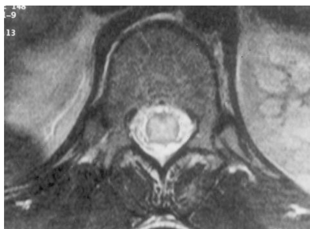
FIG 1. Axial T2-weighted image of the dorsal spine reveals hyperintensity of central gray matter, with sparing of the white matter.

pecially in the setting of postexposure prophylaxis, which per se may result in acute disseminated encephalomyelitis, can pose a diagnostic dilemma.