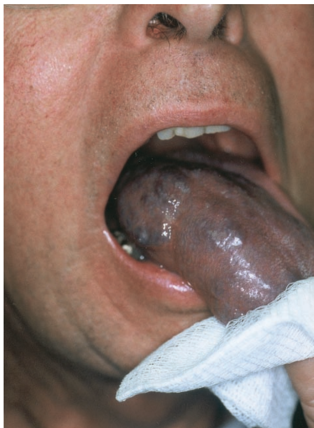
FIG 1. Image of a 42-year-old man with extensive venous malformation of the tongue.

formed with the patient under conscious sedation using midazolam (Versed; Roche Laboratories, Nutley, NJ) and fentanyl (Abbott Laboratories, North Chicago, IL).