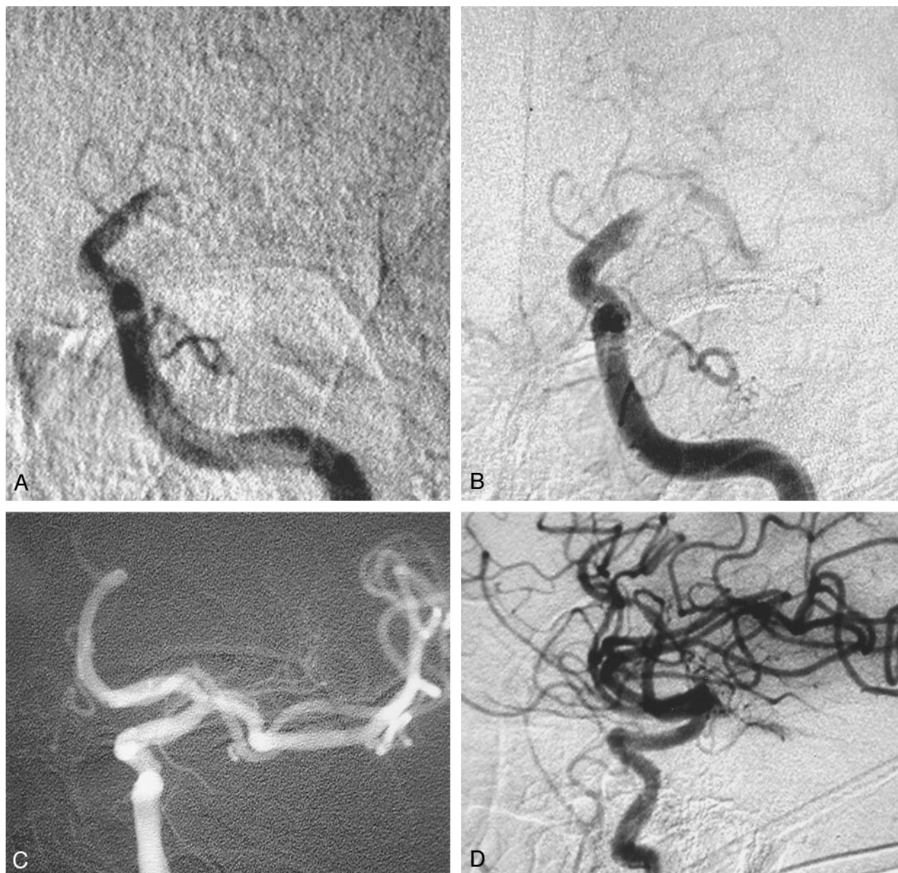
FIG 1. Case 1.

A, Left ICA angiogram, frontal projection, obtained after the intravenous t-PA infusion confirms the persistent supraclinoid ICA occlusion.