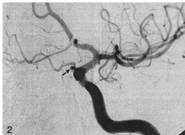
FIG 2. Follow-up digital subtraction angiogram of the left internal carotid artery, obtained 3 months after the preoperative angiogram. There is a well-defined saccular de novo aneurysm (arrow) in the origin of the left ophthalmic artery. A clip had been placed in the previous anterior communicating aneurysm.

Although all the factors described above correlate with a higher prevalence of de novo aneurysm in several studies, no consistent pattern has been described. The only common significant risk factor that has been observed is cigarette smoking (2–4, 6, 8, 12, 15, 16, 19). The risk factors for rupture are the same for both types of aneurysms (ie, familial vs non-familial) (8, 11, 21). In reality, the incidence of de novo aneurysms may be higher than accepted, because many patients may die before the diagnosis is established.