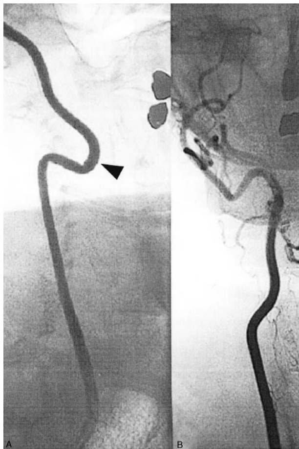
FIG 2. Frontal view digital subtraction angiogram.

A, Course of the right ICA in the neck. Note the tortuosity at the C3–C4 level (arrowhead).