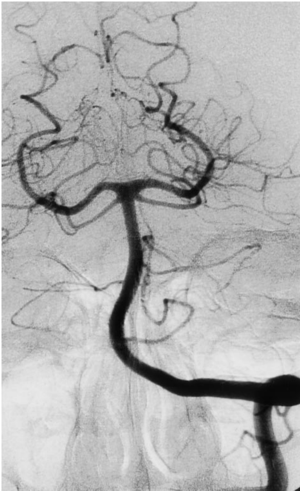
FIG 3. Follow-up angiogram obtained 6 months after stent placement shows an absence of filling of the aneurysm, normal patency of the VA and BA, and no evidence of intimal hyperplasia or concomitant vessel stenosis.

dovascular treatment in some clinical situations (eg, small curvature of the cerebral vasculature, absence of side branches on the stented segment or the possibility to sacrifice them). Future technical developments will likely improve stent-graft design and offer more sophisticated delivery systems. The long-term follow-up results of stent-graft placement, especially in cerebral vessels, are still unknown and should be studied in clinical trials.