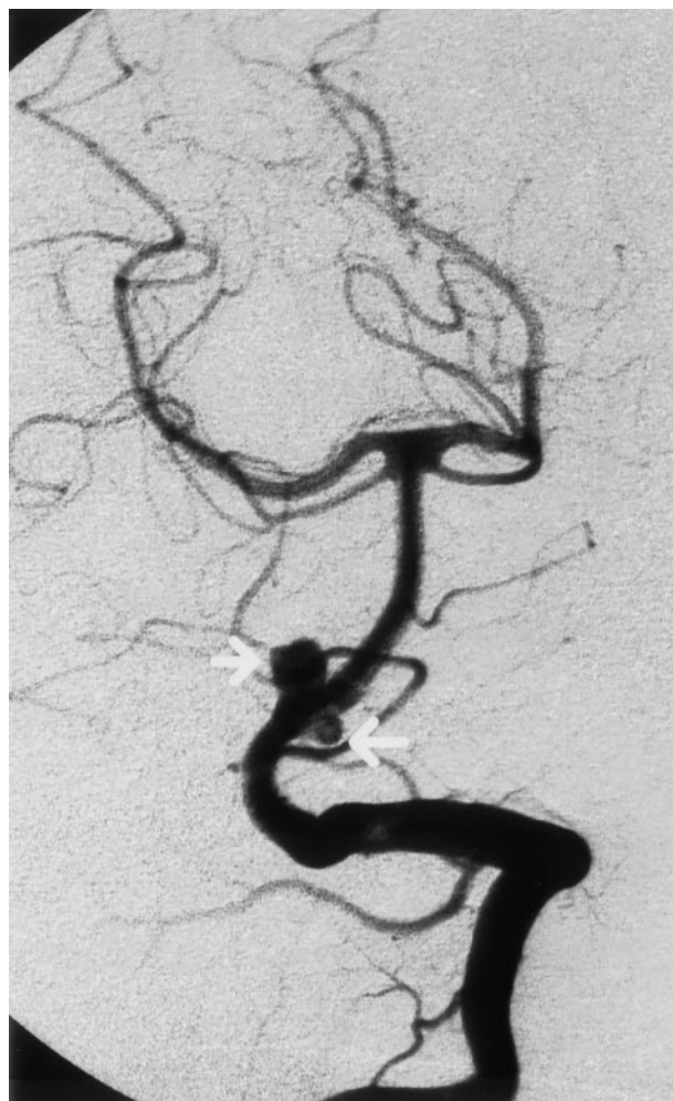
FIG 1. Initial DSA with left VA injection shows the wide-necked, irregularly shaped aneurysm of the vertebrobasilar junction (arrows)

venously), and intermittent doses of heparin were given throughout the procedure. A 7F, 90-cm guiding catheter (Vista Brite Tip Multipurpose; Cordis Europa N.V., Roden, the Netherlands) was positioned in the distal left VA. An 0.014-in microguidewire (ATW; Cordis) was passed into the left posterior cerebral artery as distally as possible to provide support. A 12 × 4-mm stent-graft (Jostent Coronary Stent Graft Supreme System with JET coating; Jomed. Unterschleibheim, Germany) was passed over the microguidewire and carefully positioned at the level of the aneurysm, distal to the origin of the left PICA and proximal to the origins of both anterior inferior cerebellar arteries. The stent-graft was then deployed across the neck of the aneurysm and the vertebrobasilar junction (Fig 2A). This system consisted of a premounted stent made of ultrathin (75 \mu m) polytetrafluoroethylene (PTFE) graft material layered be-