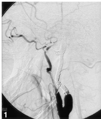
FIG 1. Angiogram obtained after embolization shows complete occlusion of the ICA with coils tightly packed in all affected portions of the right ICA.