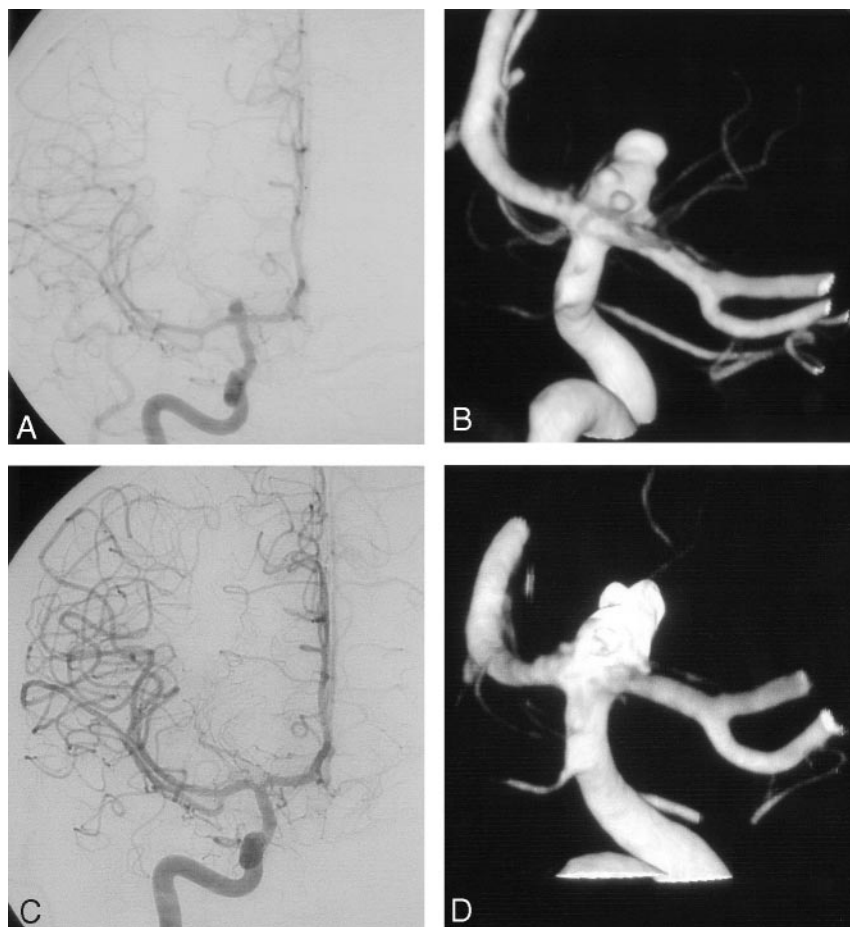
FIG 3. SAH in a 33-year-old woman.

A and B, Conventional (A) and 3D (B) angiograms of the right ICA obtained before treatment show an ICA bifurcation aneurysm with multiple daughter sacs.