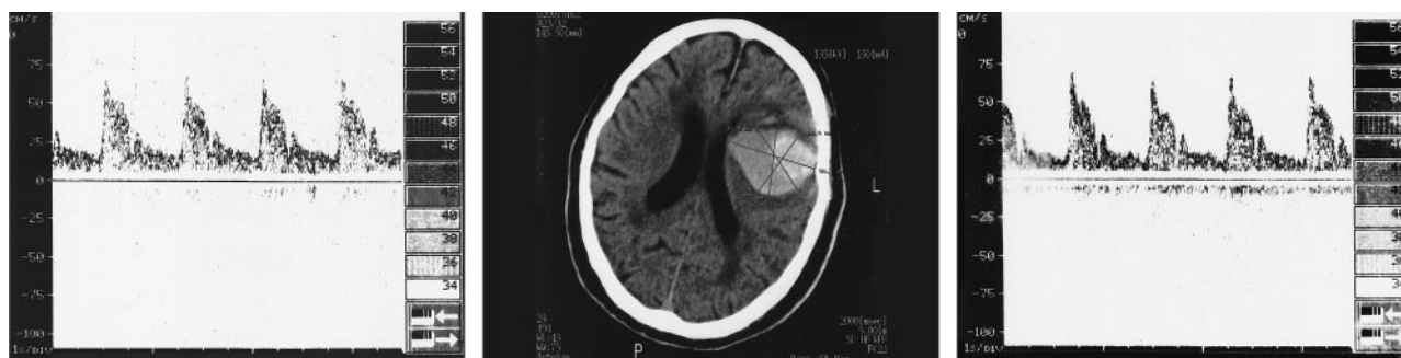
FIG 2. Patient with a high bilateral PI (aPI, 1.96; uPI, 1.72) with symmetrical flow velocities: (aVm, 28 cm/s; uVm, 29 cm/s). Center, CT scan shows a large hematoma (87.8 mL), a hypoattenuating lesion of 36.3 mL, and a midline shift of 0.2 cm; Left, Doppler recording corresponding to the right hemisphere; Right, Doppler recording corresponding to the left hemisphere.

sure the ICP, realizing that TCD really measures the flow dynamics related to intracranial compliance. Finally, we acknowledge that the variance of most CT data explained by the TCD results is rather low.