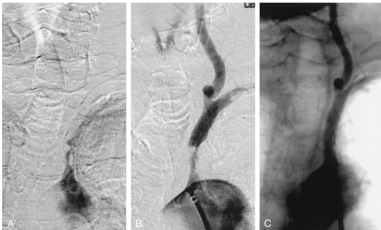
FIG 1. A, Occlusion of the left subclavian artery.

B, Appearance of the left subclavian artery after predilatation with 4 \times 40 mm balloon. Antegrade opacification of the left vertebral artery.