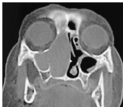
FIG 1. Noncontrast coronal CT scan shows a low-attenuated mass in the right nasal cavity without apparent erosion of the bone.

A biopsy was performed, and the pathology report was consistent with hemangioma. Macroscopic examination at the time of surgery revealed a smooth mass arising from the nasal septum. The lesion was removed at our hospital, and the