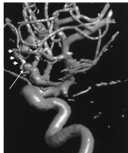
FIG 2. 3D-DSA image of the left internal carotid angiography during the rerupture of the aneurysm clearly demonstrates a jet of blood flow (small arrows) coming from the daughter aneurysm (large arrow).

recovery and returned to her home on foot with only slight mental impairment 8 weeks after the operation.