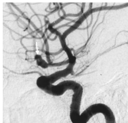
FIG 1. Lateral view of the left internal carotid angiogram taken immediately before the rerupture shows a small daughter aneurysm on its anterior wall (arrow).

A 49-year-old woman was admitted to our department after complaining of severe headache, the cause of which was diagnosed as subarachnoid hemorrhage by CT scan. She was well oriented and showed no focal neurologic deficit. Angiography was performed following the CT scan. Angiography of the left internal carotid artery revealed an anterior communicating artery aneurysm, which had a small daughter aneurysm on its anterior wall (Fig 1). To clarify the exact anatomic relationship between the aneurysm neck and bilateral anterior cerebral arteries, which was thought to be useful preoperative or preembolization information, 3D-DSA (Integris Allura; Philips, Best, the Netherlands) was performed. During rotation of the C-arm, rebleeding of the aneurysm occurred. An extravasation of the contrast media from the daughter aneurysm was visible on the 3D-DSA image (Fig 2). The 3D-DSA image also revealed that the daughter aneurysm had a connection to the aneurysm dome with very narrow lumen (Fig 3). This finding suggested that the daughter aneurysm was not a true aneurysm, but a pseudoaneurysm located on the rupture site. After the rebleeding, the patient was in a comatose state. Therefore, she underwent emergency aneurysmal neck clipping and hematoma removal, and this was followed by ventricle-peritoneal shunt 5 weeks after the operation. She showed good postoperative