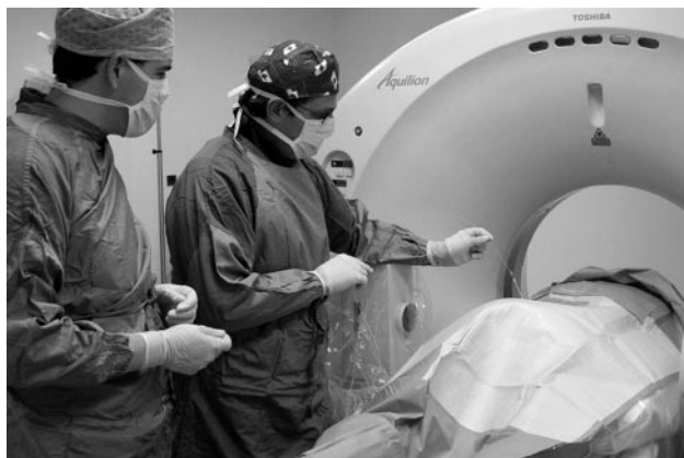
Fig 1. PLDD in progress

*In this trial, each patient was assigned to 1 of 3 groups: 1) those who met all selection criteria for PLDD (leg pain, positive physical examination finding such motor, sensory, or reflex deficits, and/or straight leg raise, contained disk herniation confirmed by diskography); 2) those who did not meet the selection criteria (had a normal physical examination, the presence of stenosis, spondylolisthesis, extruded disk fragment, leakage of diskographic dye from the outer annulus, multiple prior lumbar surgeries; or 3) those who could not be assigned to either of the first 2 groups for reasons such as diskography not being performed or inadequate physical examination data recorded in the chart. In group 1, 29 of 41 patients (70.7%; CI, 57%–85%) had successful outcomes. In group 2, 12 of 42 patients (29%; CI, 12%–42%) had successful outcomes. In group 3, 45 of 81 patients (56%; CI, 45%–66%) had successful outcomes. In group 4, 20 of 45 patients (44%; CI, 30%–59%) had successful outcomes.