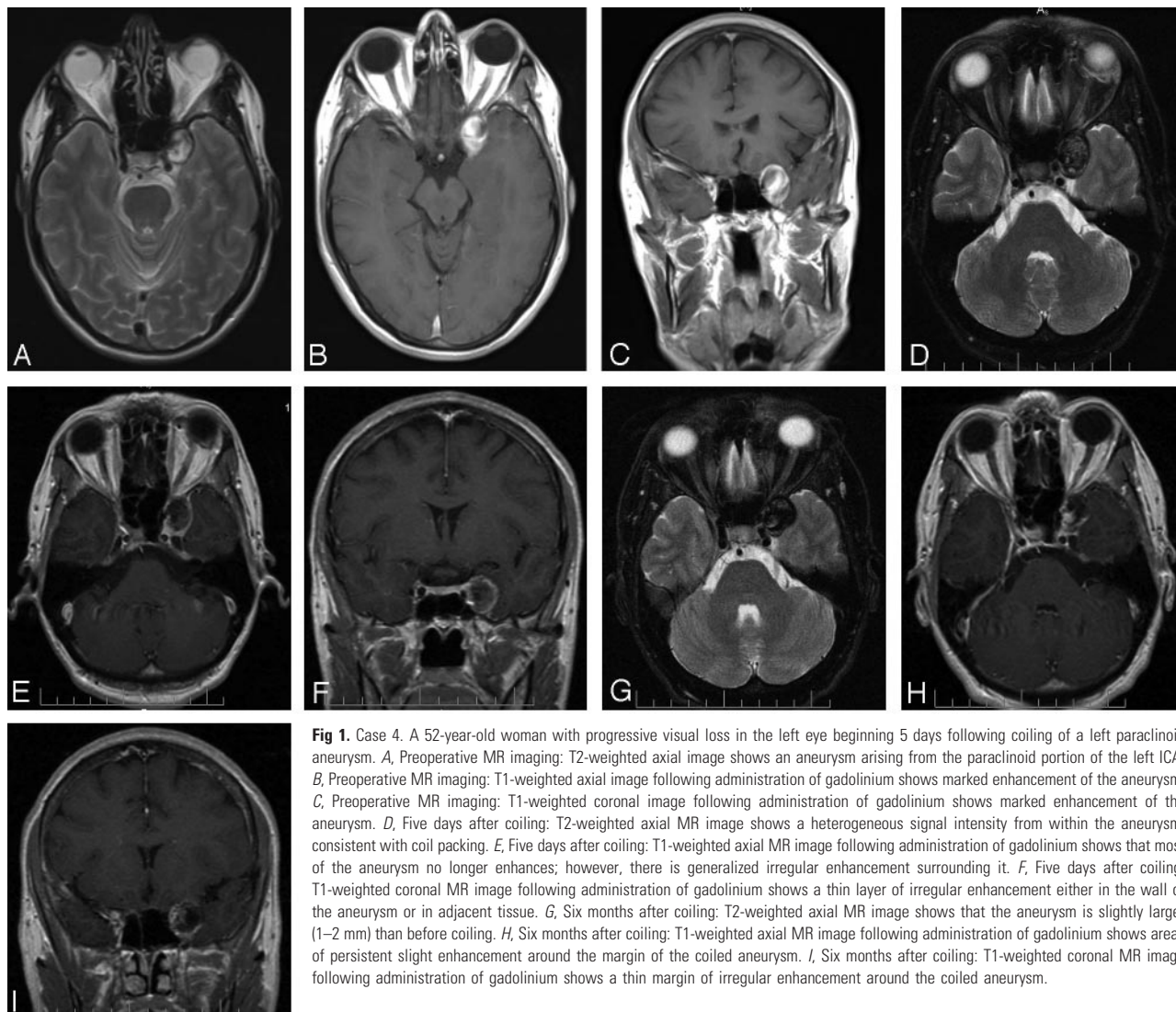
Fig 1. Case 4. A 52-year-old woman with progressive visual loss in the left eye beginning 5 days following coiling of a left paraclinoid aneurysm. A , Preoperative MR imaging: T2-weighted axial image shows an aneurysm arising from the paraclinoid portion of the left ICA. B , Preoperative MR imaging: T1-weighted axial image following administration of gadolinium shows marked enhancement of the aneurysm. C , Preoperative MR imaging: T1-weighted coronal image following administration of gadolinium shows marked enhancement of the aneurysm. D , Five days after coiling: T2-weighted axial MR image shows a heterogeneous signal intensity from within the aneurysm, consistent with coil packing. E , Five days after coiling: T1-weighted axial MR image following administration of gadolinium shows that most of the aneurysm no longer enhances; however, there is generalized irregular enhancement surrounding it. F , Five days after coiling: T1-weighted coronal MR image following administration of gadolinium shows a thin layer of irregular enhancement either in the wall of the aneurysm or in adjacent tissue. G , Six months after coiling: T2-weighted axial MR image shows that the aneurysm is slightly larger (1–2 mm) than before coiling. H , Six months after coiling: T1-weighted axial MR image following administration of gadolinium shows areas of persistent slight enhancement around the margin of the coiled aneurysm. I , Six months after coiling: T1-weighted coronal MR image following administration of gadolinium shows a thin margin of irregular enhancement around the coiled aneurysm.

One was the patient who died shortly after a craniotomy to decompress the optic nerve (case 3).