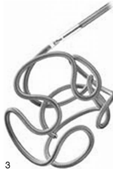
Fig. 3 GDC 10 3D coil.

tems, Best, the Netherlands) with the use of general anesthesia and systemic administration of heparin. Intravenously or subcutaneously administered heparin was continued for 48 hours after the procedure, followed by 80 mg of aspirin daily for 3 months. The aim of coiling was to pack the aneurysm as densely as possible, until not 1 more coil could be placed.