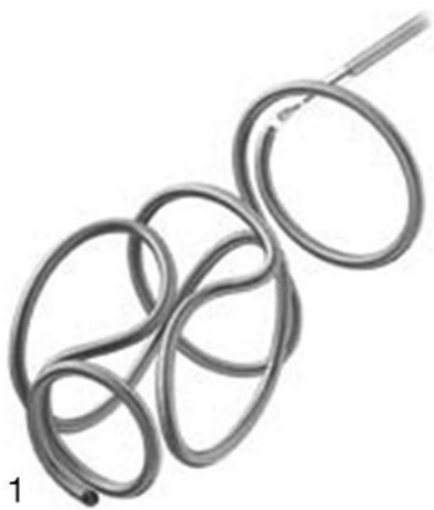
Fig 1. GDC 360° coil.