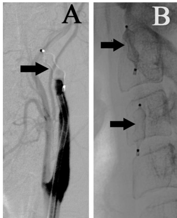
Fig 1. A, Left ICA angiogram 5 minutes after deployment of 8-mm vascular plug (arrow) demonstrates complete ICA occlusion.

We have had 4 other cases in which the vascular plug has been successfully used, 3 to occlude the carotid circulation and 1 to occlude the