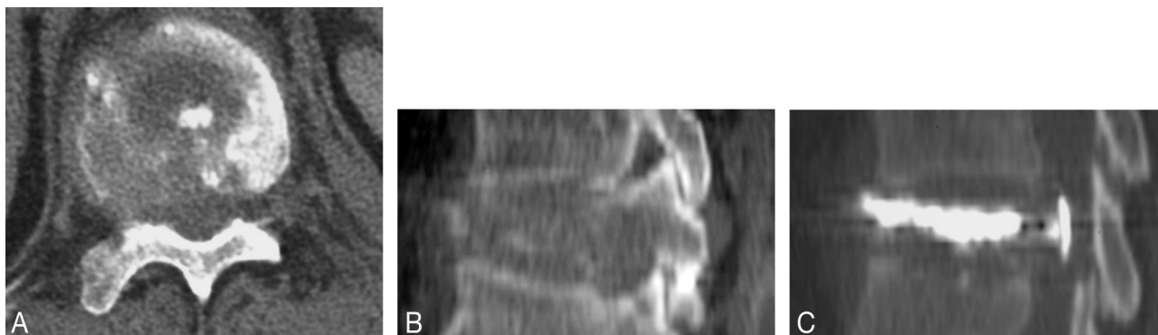
Fig 3. Example of a mixed vertebral metastasis presenting a posterior wall disruption associated with an epidural tumoral component; the patient didn't present any neurologic symptom. Prevertebroplasty transverse (A) and sagittal (B) CT scan reconstruction obtained through level of L4; sagittal reconstruction after cement injection (C) shows an intracanal leak.

cal follow-up after the treatment of 40 vertebrae, among which were 30 lytic metastases and 10 myeloma lesions.