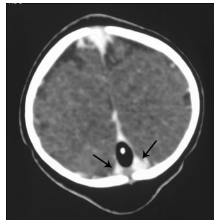
Fig 1. Contrast-enhanced CT shows subcutaneous lipoma and interparietal lipoma with central calcification. Note the duplication of sagittal sinus (arrows) and the defect in the parietal bone.

MR images revealed a posterior interhemispheric mass lesion, hyperintense on T1-weighted image (Fig 2) and hypointense on fat-suppressed T2-weighted image, consistent with lipoma. The lesion was extending to a subcutaneous lipoma through a defect in the parietal bones. Within the inferior part of the intracranial lipoma, a round mass, isointense on T1-weighted image and hyperintense on fat-suppressed T2-weighted images, was present, which was thought to be parenchymal tissue. The mass located within the lipoma had a connection with the tectum stretching it posteriorly and superiorly