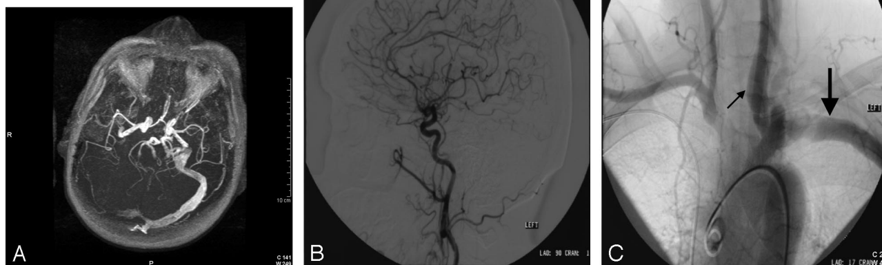
Fig 1. A, Axial MRA maximum intensity projection (MIP) (TR, 34; TE, 4) shows signal intensity within the left cavernous sinus, petrosal sinus, and transverse sinus. B, Digital subtraction lateral angiogram with selective injection of left internal carotid artery. There is no evidence of venous flow, but there is some reflux into the external carotid artery. C, Conventional angiogram, late arterial phase, shows early filling of left subclavian vein ( large arrow ) due to ipsilateral AV fistula and retrograde flow in the left jugular vein (with the left common carotid artery superimposed) ( small arrow ).